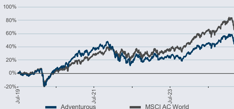
Share class returns to 31 Mar 2025 (%)